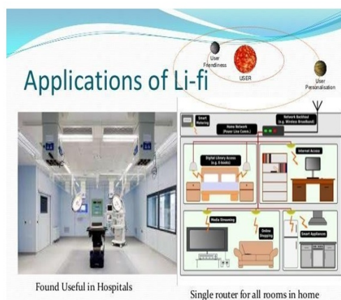
Fig. 2 Applications

Apart from the usage in monitoring of patients two very important services are emergency alert Medical claim andRobotics surgery. Li-Fi is particularly suitable for many popular internet “content consumption” applications such as