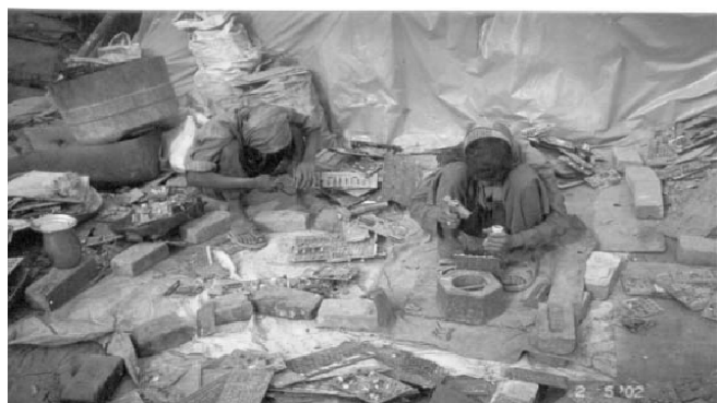
Fig.3 Children working with toxic waste

There are no harmless substances. There are only harmless ways of using substances. E-waste/ Industrial waste putting children at risk(Fig. 3) is estimated that 50 percent of all used e-waste is “dumped” into India, China and African countries, where it is a common practice for children (and some adults) to make money “backyard recycling” scrap electronic products over open fires to remove reusable components. Electronic waste is the major issue in India. It affects many people either directly or indirectly. E-waste/ Industrial waste creates a lot of economic and environmental losses to our country.