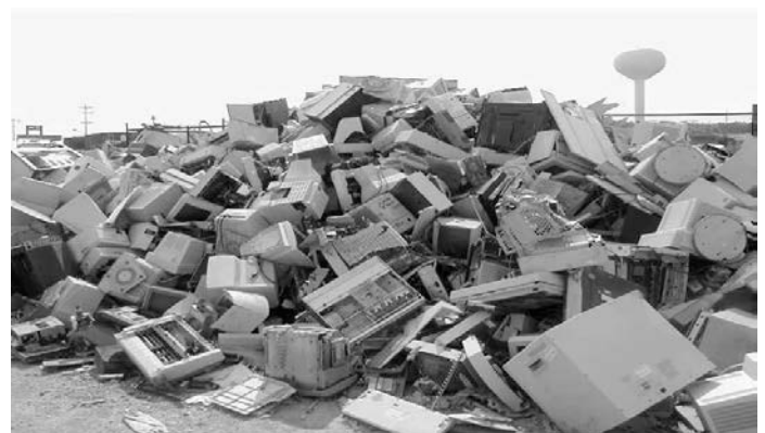
Fig. 2 Heap of e-wastes

If data centers are 20 percent competent, we could save 22 million tonnes of carbon dioxide Intel's 45nm and next generation 32 nm products are all 100 percent halogen-free and employ lead-free technology. 170billion kilowatts are being wasted by consumers due to insufficient power usage information and 30 percent of energy consumed by buildings is being wasted per annum.