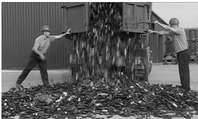
Fig. 1 E-waste/ Industrial waste transportation

The Electronic products comprise of Industrial waste / e-wastes which have reached their end-of-life stages, like televisions, PCs, mobile phones, electrical appliances, etc. The e-waste is one of the fastest growing types of waste in the developed world. In view of the growing threat of e-waste generation and large scale involvement of the unorganized sector in processing e-waste in an environmentally unsound