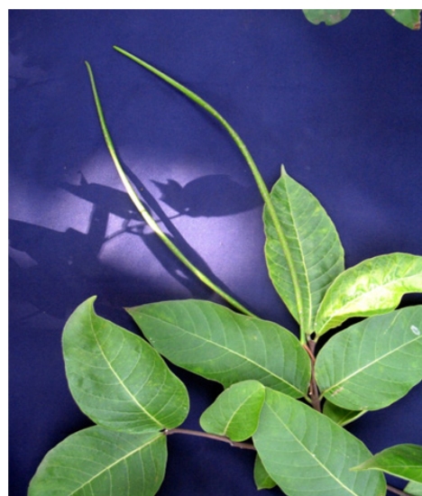
Fig. 2 A twig of Holarrhena Antidysenterica